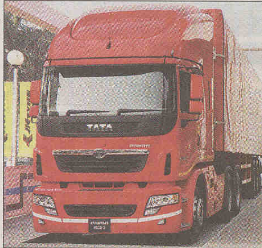
■ (Left) An old Tata truck and (right) a truck from the company's newly-launched Prima range. Much of the transformation in heavy commercial vehicles is due to regulatory pressures.